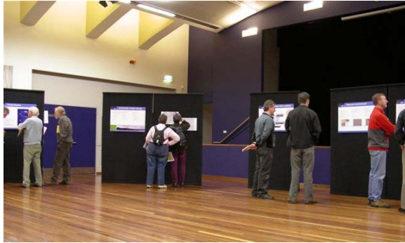
Tallawarra Lands Community Information and Feedback Session, July 22, 2006

This information has been passed onto Willana Associates, who were present at the community session, as an input into the local environment study that will set the framework for future planning of Tallawarra Lands.