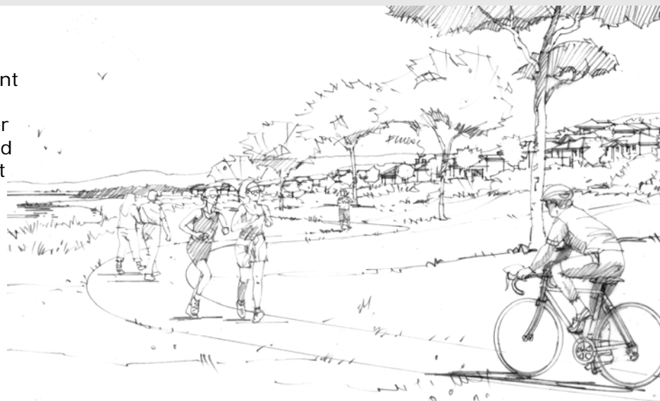
Artist's impression of Tallawarra Lands site

TRUenergy intends to lodge the Concept Plan with the Department of Planning within the next few months. We will keep you informed of the progress of this lodgement in future newsletters.