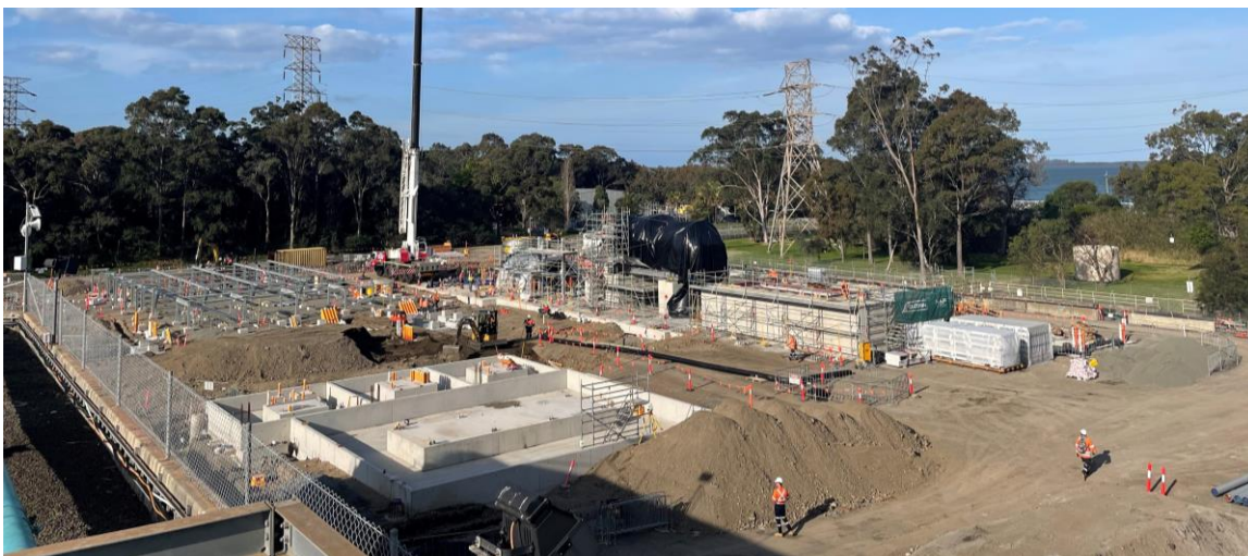
Above: Construction is already underway at Tallawarra B power station

The Construction is already well underway on Tallawarra B and the project will be ready for the summer of 2023-24, around the time of the scheduled retirement of the Liddell power station.