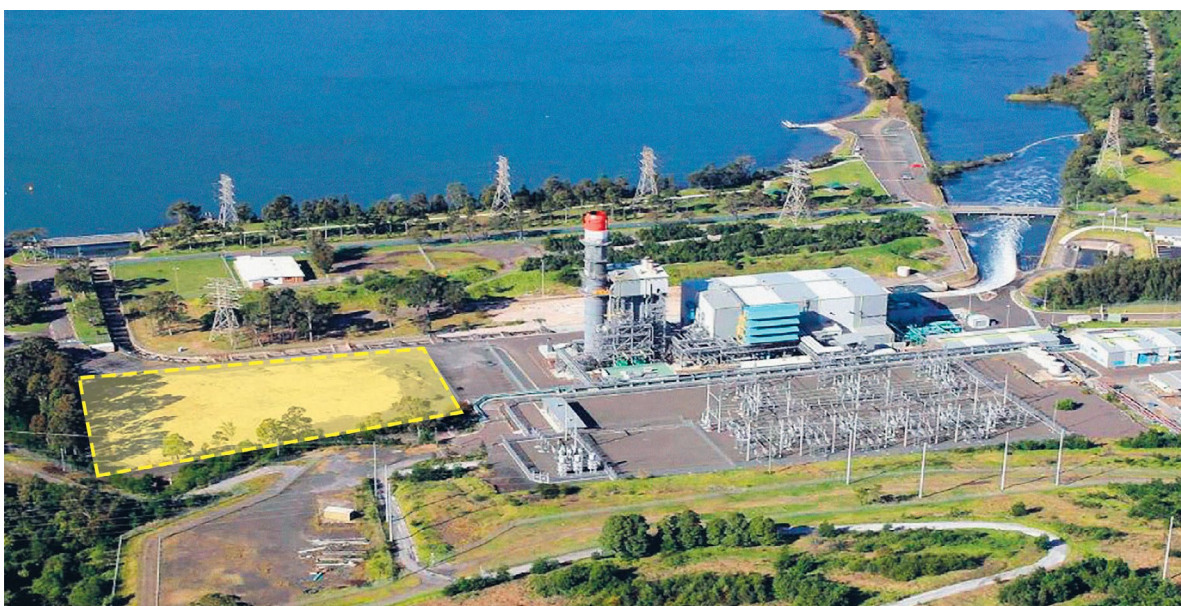
Above: EnergyAustralia's existing Tallawarra power station. Shaded area indicative of the Tallawarra B project location.

Matt Kean MP, Minister for Energy and Environment