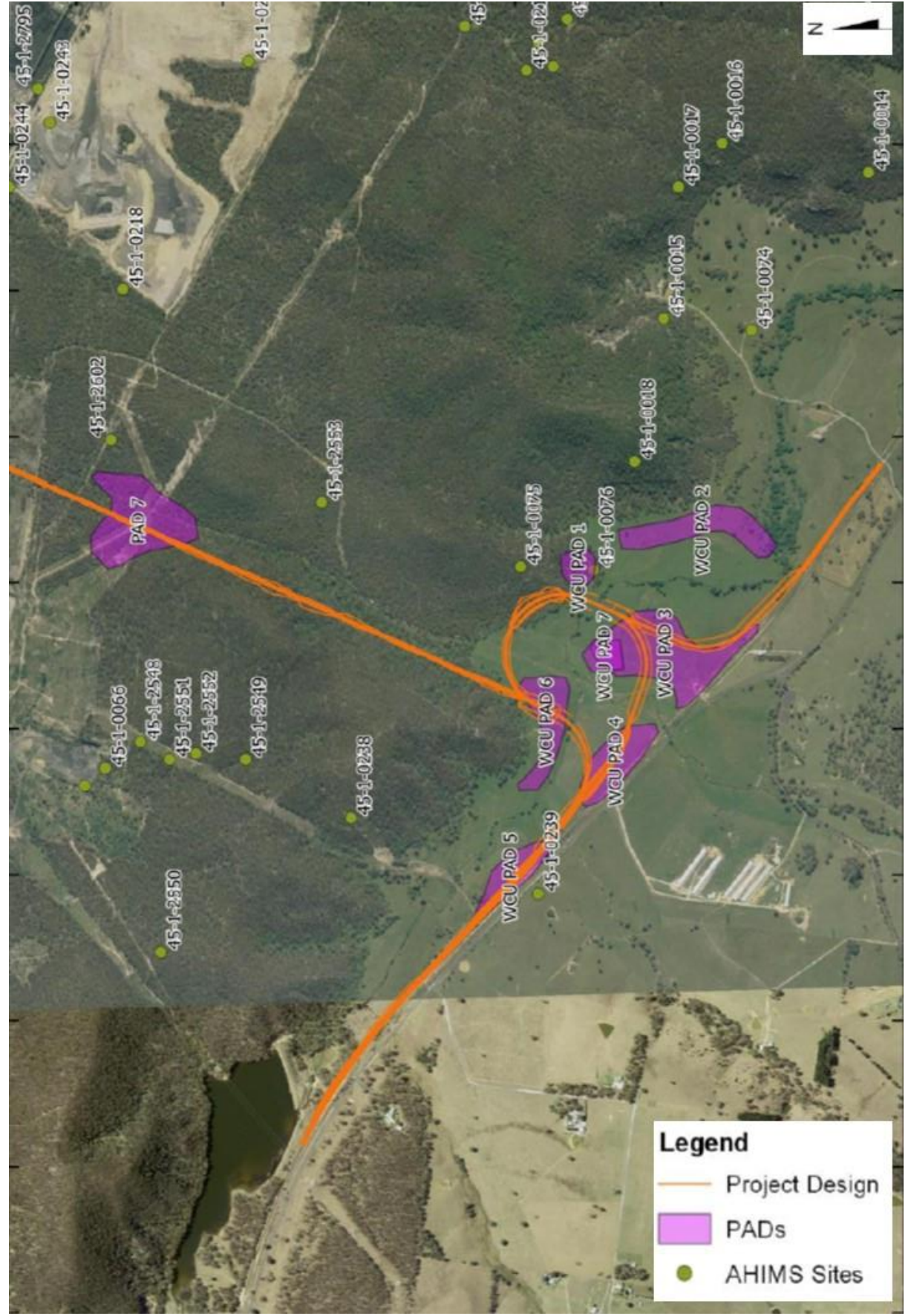
Figure 1: Location of the Identified Potential Archaeological Deposits