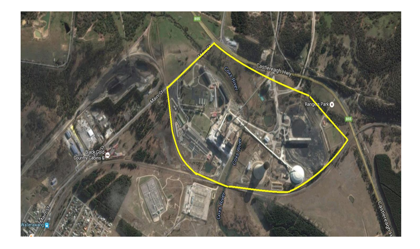
Figure 2: Aerial photo of the Wallerawang Power Station Site